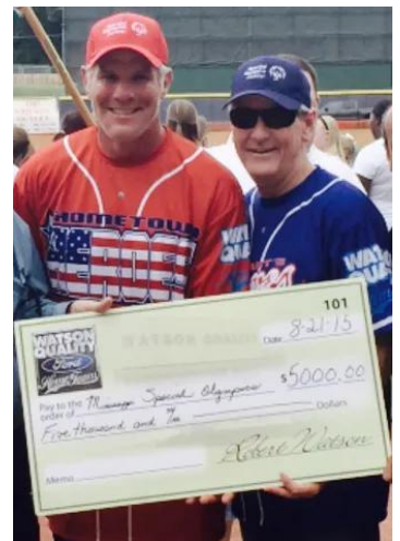
Former Gov. Phil Bryant (right) poses with Brett Favre (left) and a $5,000 check from a local car dealership to the Mississippi Special

Then, two days after he left office, Bryant agreed by text to accept stock in the company.