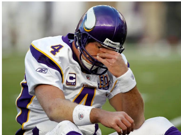
In this Oct. 31, 2010, file photo, Minnesota Vikings quarterback Brett Favre rubs his eyes after being hit by New England Patriots linebacker Gary Guyton during the first quarter of an NFL football game in Foxborough, Mass. Favre played a major role in welfare spending in Mississippi.