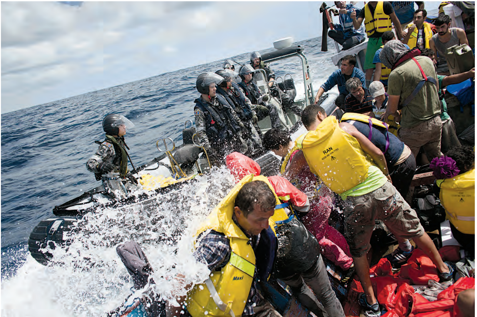
THE ASYLUM SEEKERS after pleading with Australian sailors to take a suffering passenger.