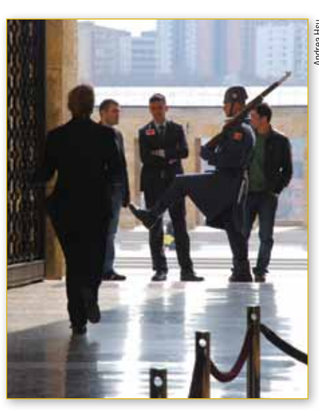
On guard at the Ataturk Mausoleum in Ankara.