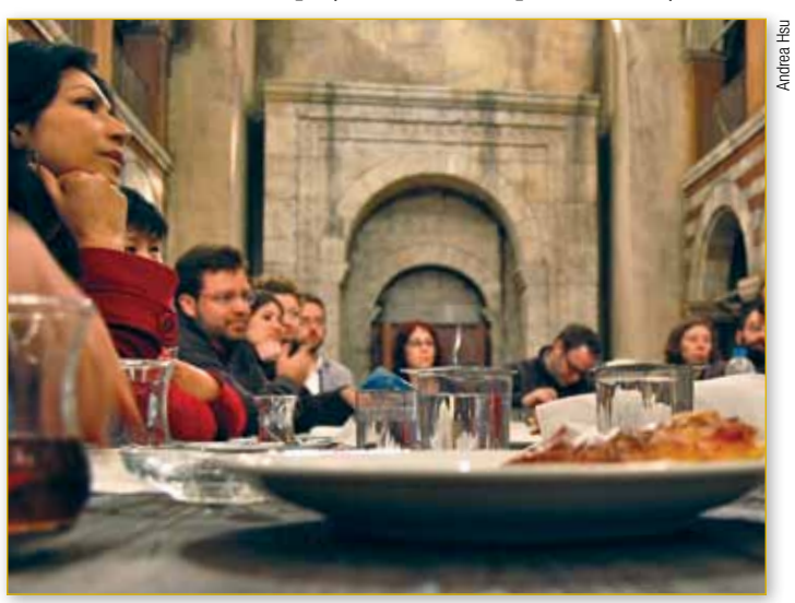
Fellows at Izmit TV Studios, Izmit, Turkey

We wrapped up on a sobering and instructive note, meeting with a pair of journalists alarmed by the government's heavy-handedness. But the more we learned, the murkier things got. The newsmen were in the employ of a media empire owned by the