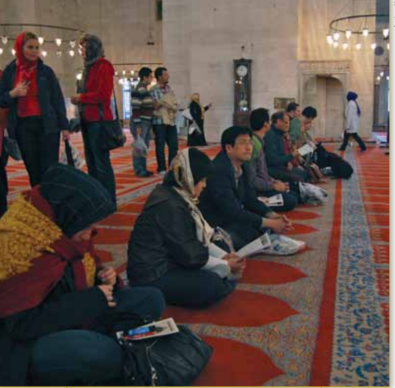
KWF fellows with locals at the Suleymaniye Mosque, Istanbul.

upon whom you ask, there are more than 100 journalists in jail or as few as four. Tens of thousands of others are awaiting trial on terrorism charges. Mention the Kurdish question and people twitch.