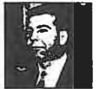
Mayor Philip Giordano

"The superintendent has pathetically little to do with hiring. But that is not anything new in Waterbury."