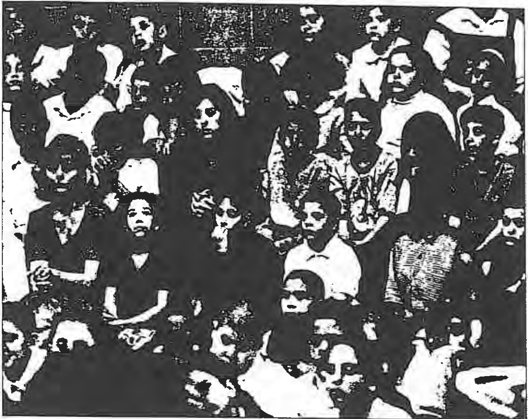
Students and faculty gather in the gymnasium of East Farms School in Waterbury to listen to a presentation. On any given