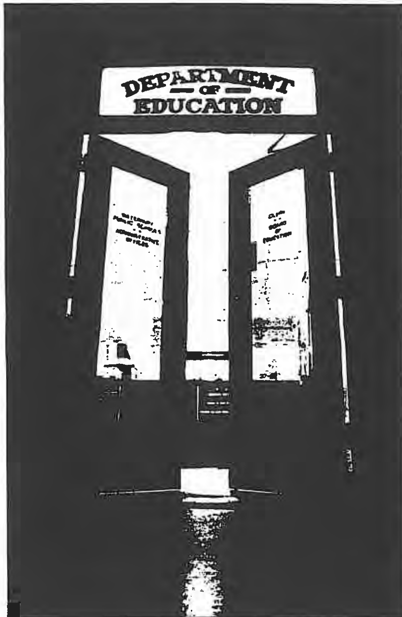
The Waterbury school department, headquartered on the third floor of the Chase municipal office building, employs 1,100 teachers and hires about 70 new ones a year.

Waterbury politics plays premier role in hiring teachers, administrators