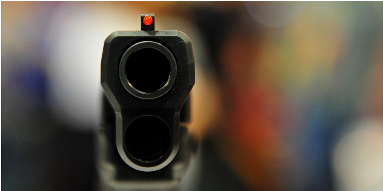
A semi-automatic handgun is displayed at the 2015 NRA Annual Convention in Nashville, Tennessee.